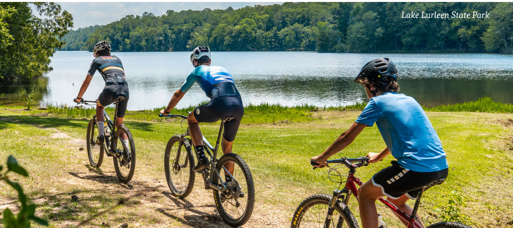
Lake Lurleen State Park

Check out the seven best swimming holes in Tuscaloosa!