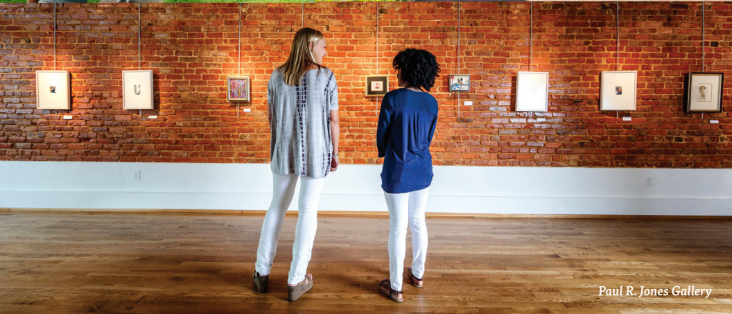
Paul R. Jones Gallery