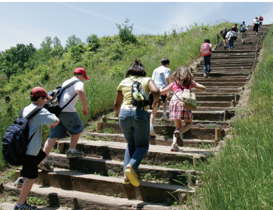
Clockwise: Moundville Archaeological Park, Alabama Museum of Natural History, Denny Chimes

Whether you're searching for family-friendly fun, the perfect date-night spot or an outing with friends, here's your ultimate guide to fun in Tuscaloosa and Northport.